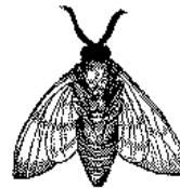
Figure 3. A sample black and white graphic that has been resized with the includegraphics command.

As was the case with tables, you may want a figure that spans two columns. To do this, and still to ensure proper "floating" placement of tables, use the environment figure* to enclose the figure and its caption. And don't forget to end the environment with figure* , not figure !