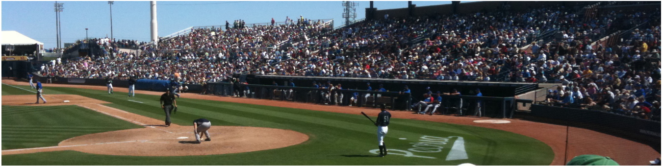
Figure 1. This is a teaser